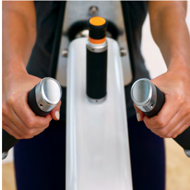
Elliptical-shaped ergonomic grips. Comfortable, natural-feeling motion. Eight upper body units with independent motion. Inviting low-profile towers.

Insignia Series. The optimal interaction between exerciser and machine.