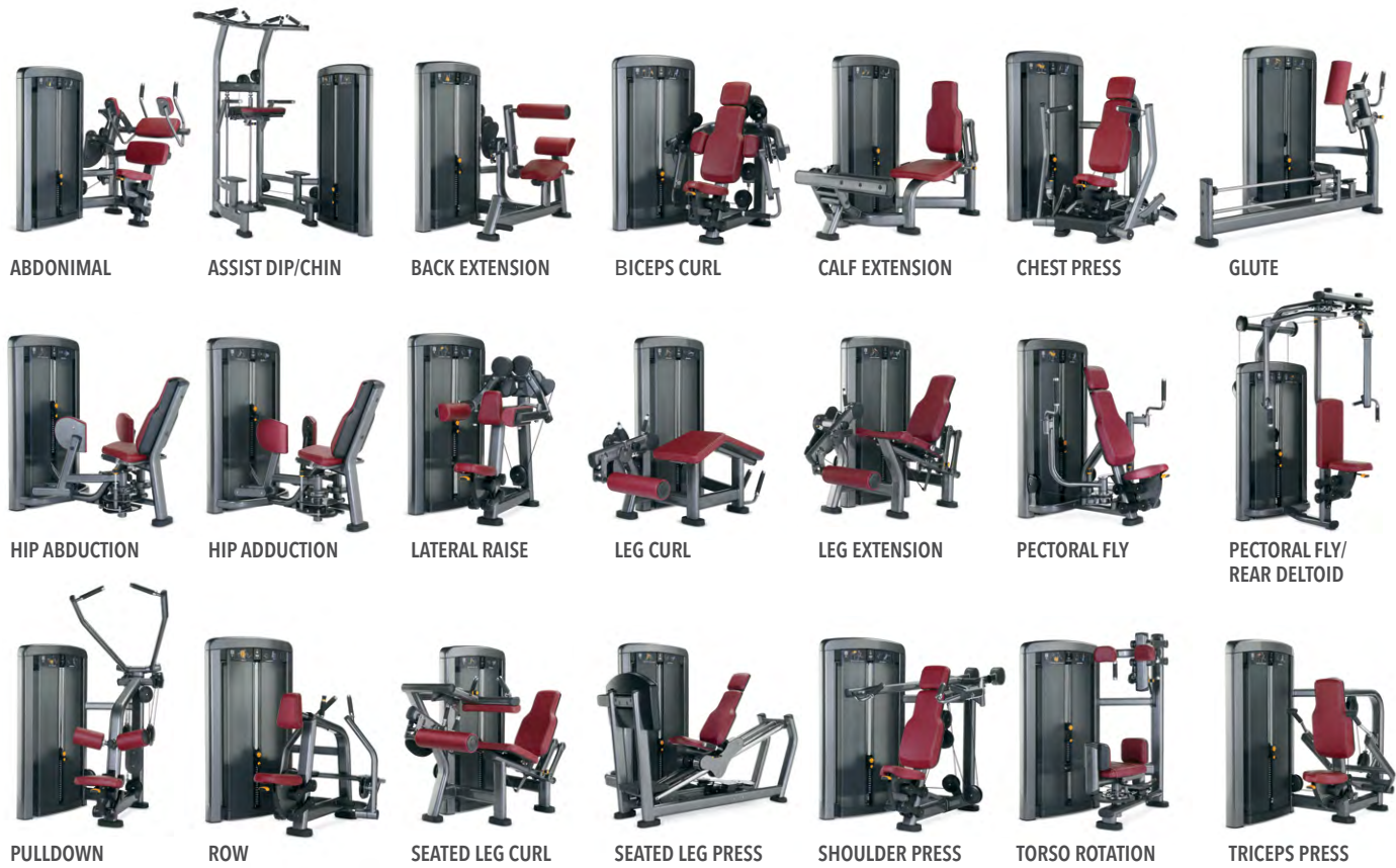
ABDONIMAL ASSIST DIP/CHIN BACK EXTENSION BICEPS CURL CALF EXTENSION CHEST PRESS GLUTE