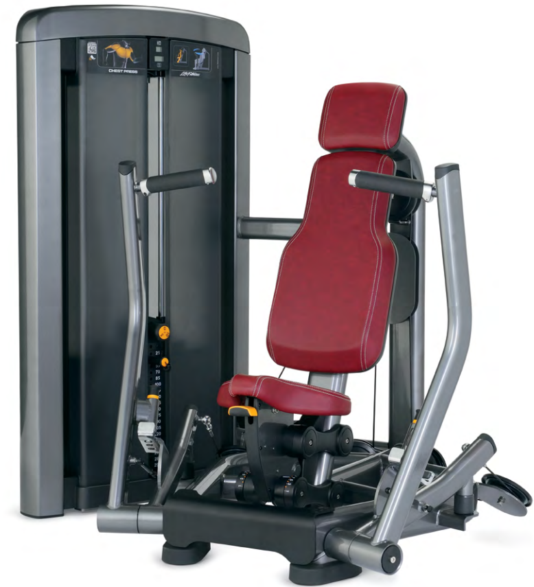
FEATURED: Chest Press with Titanium frame and Cranberry double-stitched upholstery