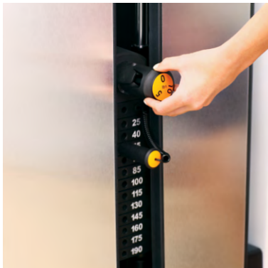
Adjustments are easy and intuitive.