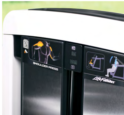
Placards for clear instructions. QR codes and NFC capability for workout tracking.