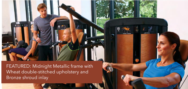
FEATURED: Midnight Metallic frame with Wheat double-stitched upholstery and Bronze shroud inlay